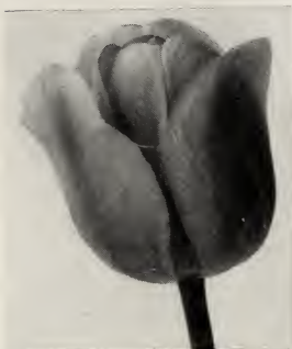
Single Tulip Keizerkroon